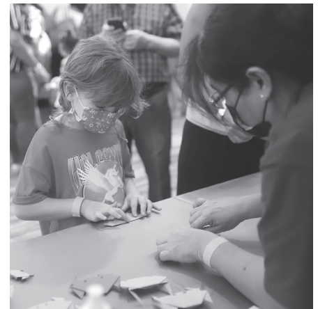
Origami is a fun way to teach mathematics.