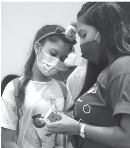
A FUNDAPROMAT volunteer explains the mathematics of a Rubik's Cube to a participant.