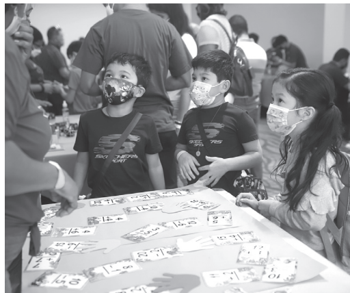
Kids enjoy exploring the beauty and richness of mathematics through games and puzzles.