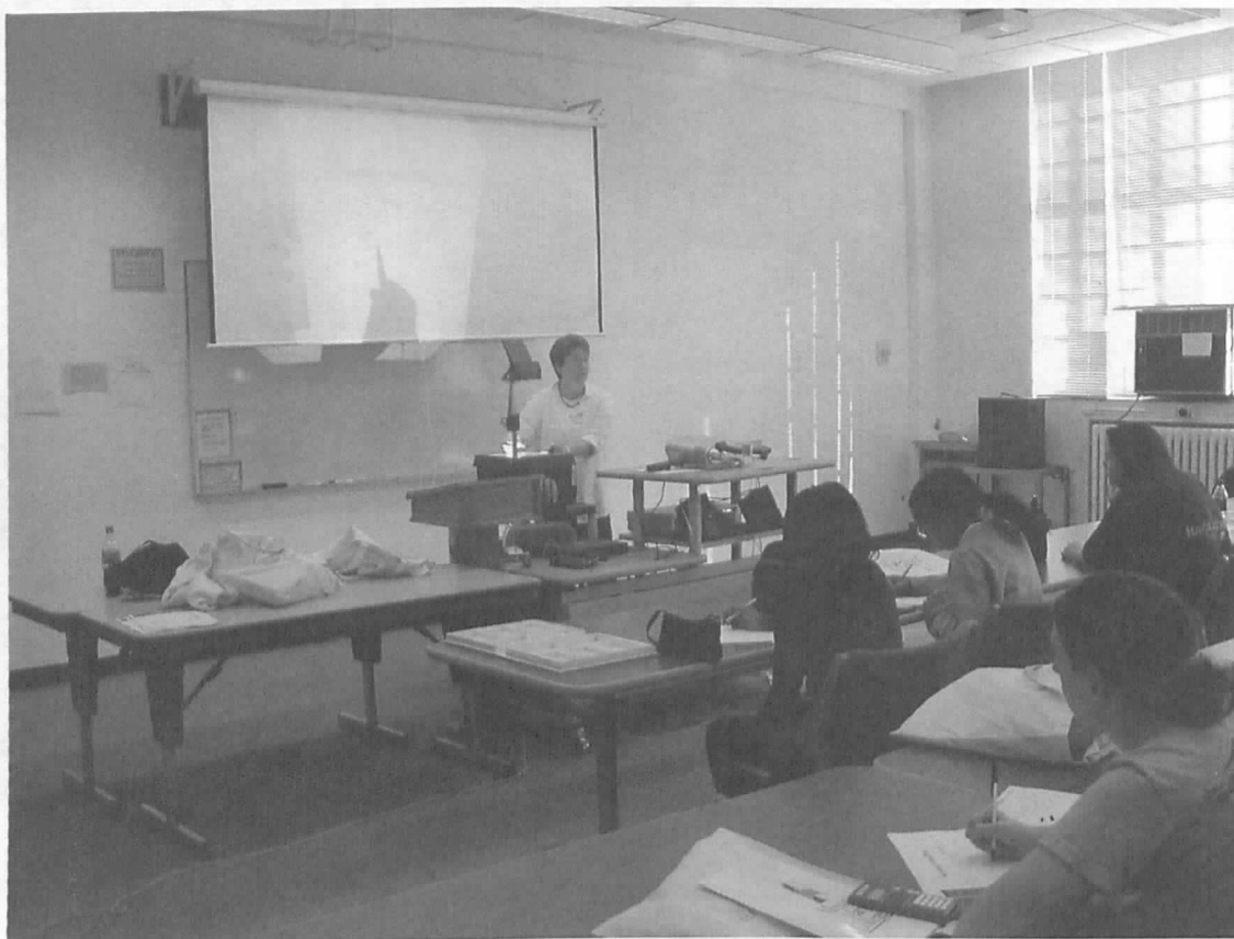
RSA Workshop at Mount Mary SKHS Day