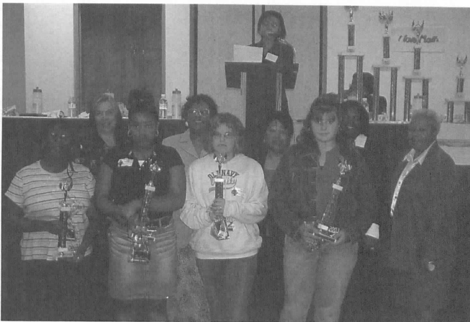
Elizabeth City State SKHS Day Essay Contest Winners

Although at times I wanted desperately to fit in better, I liked being "smart" and never considered abandoning the study of math. Having decided that teaching math was the best career imaginable, as I continued my education I learned that despite all the gender issues, being a math professor at a university was exactly where I would "fit in."