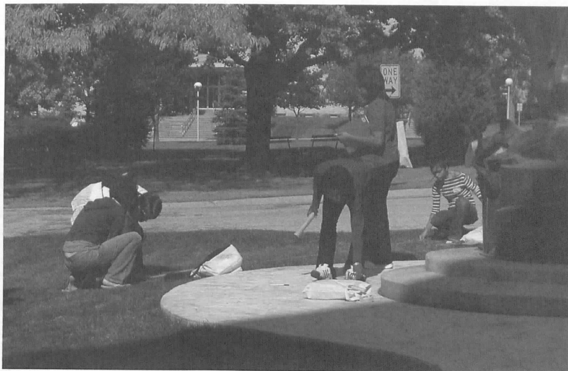
Scavenger Hunt Workshop at Mount Mary SKHS Day

has 32 white squares but only 30 black squares. After a few minutes of unsuccessful trying, I provided students with the hint that each domino can cover exactly one white and one black square, regardless of the position of the piece on the board. Students quickly realized that this is the reason that the board can't be covered with dominos as in the rules of the puzzle.