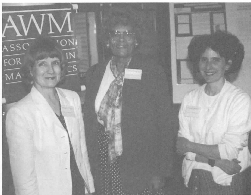
Three Plenary Speakers: Margaret Wright, Evelyn Boyd Granville, Diane Lambert

The speaker reflects on growing up in the nation’s capital at a time when schools in the city were segregated by race, and being the beneficiary of excellent academic training provided by dedicated teachers. She looks ahead at what can be done to