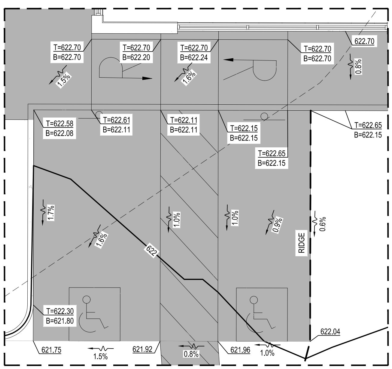
ADA PARKING ENLARGEMENT SCALE: 1"=5'