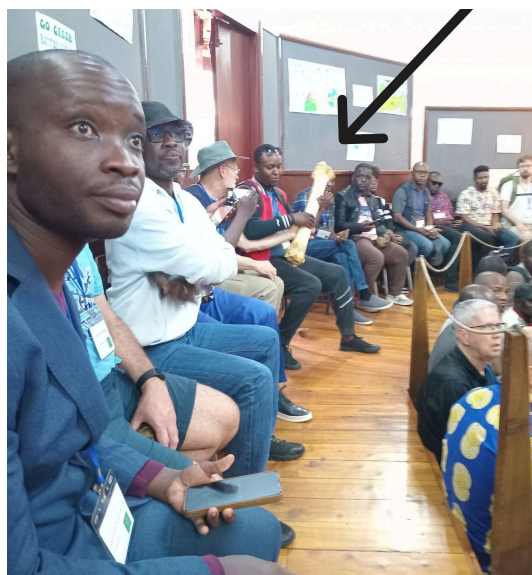
The shin bone of a giraffe, Very heavy!

First, we went to the Giraffe Center where we learned about the endangered Rothchild Giraffes of Kenya. Since the Giraffe Center and its breeding program were founded in 1979 the number of Rothchild Giraffes has grown from 130 to over 1,000. We also learned about many programs at the center which save them money such as treating waste water with plants to reuse to flush toilets, making charcoal briquettes instead of buying them, making compost instead of buying fertilizer. We thought these were good ideas for ourselves.