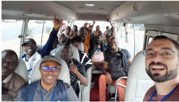
On the bus

Next we went to a convent for lunch. We were served many nice things including pumpkin soup and fresh mango for each of us. We were very well fed. We stopped at Junction Mall for shopping for gifts to bring home to our families and coworkers and then we returned to Ruiru.