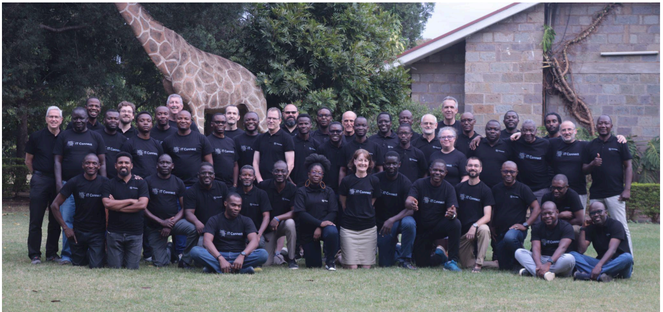
Group Photo at the conference center in Ruiru. Note: a statue of a giraffe, not a real one, behind in background.