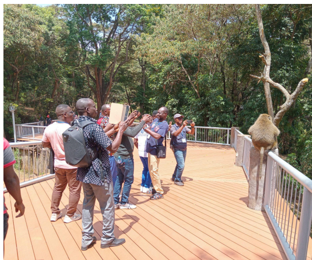
A baboon posing for photos for us