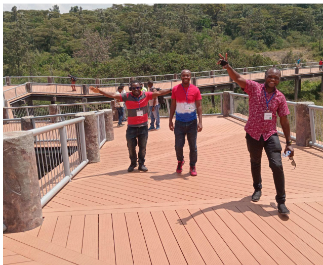
Walking on the boardwalk above the savannah

Next, we took our buses to Nairobi National Park where our guide showed us many kinds of animals of Kenya — crocodiles, a lion, a leopard — who was hard to see hiding in a tree —, wildebeasts, cape buffalo, rhino, Thompson gazelle, antelope, wart hogs, black and white colobus monkeys and baboons.